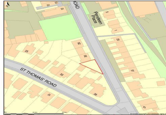
Land South 30 Pargolla Road, Newquay, Cornwall, TR7 1RP